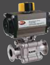
SERIES SN TUBE WELD & TRI-CLAMP ENDS